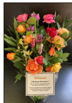
Flowers, from Winthrop Gardens, laid at Windsor Castle.